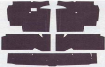
1968-1972 Sound Deadener (Standard Style) - 7Pc

Sound Deadener Carpet Underlay. Reproduction Sound Deadener Carpet Underlay. This is made out of 2 different materials, One is Tar Rubber Material and the other is closer to the original, not quite as thick as the Tar Rubber Material and softer. The picture is just an example of a Sound Deadener Carpet Underlay, not the one you will receive. Correct die cut replacements for your model.