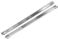
1968-1972 Stainless Steel Sill Plates - PR

Beautiful Stainless Steel replacement sill/scuff plates won't dent or scratch as easily as an aluminum part.(-Fisher" Decal not included.)