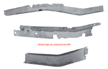
1966-1974 Frame Rail Caps (Front)

Repair your frame rail rust economically with Safe-T Caps in full length or partial lengths. Full length cap repairs the frame rail from the radiator core support to the torsion bar cross member. Front section cap repairs the frame from the core support to the firewall, while the rear section repairs the frame from the firewall to the torsion bar cross member. All caps are made in the USA. Call for multiple colours, styles or patterns or choose online