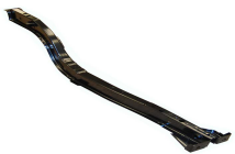
1968-1970 Rear Frame Rail - LH

Made from quality heavy gauge steel, each piece is built to original OE specs . Don't get stuck with low quality cheap replacements parts, buy the best. Shock tower included with rail.Fits: 1968-1970 B-Body cars