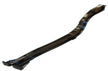
1968-1970 Rear Frame Rail - RH

Made from quality heavy gauge steel, each piece is built to original OE specs . Don't get stuck with low quality cheap replacements parts, buy the best. Shock tower included with rail.Fits: 1968-1970 B-Body cars