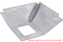
1966-1972 Torque Boxes

At the factory, torque boxes were known as "Hemi boxes" or "double floor plates". These resist torsional flex, and when combined with subframe connectors, add 20%+ rigidity to the framework. These are not factory-stamped pieces for show car points, these are heavy-duty, performance-oriented structural enhancements. Made in the USA Call for multiple colours, styles or patterns or choose online