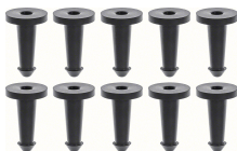
1973-1974 Firewall Insulation Fastener (Rubber) - 10Pc

Reproduction firewall insulation fasteners for all 1973-74 Mopar A, B, and E-Body models. These fasteners are made to the same specifications using molded rubber materials as the original, have a 3/4" diameter head and are 1-1/4" long. Installed on cars built after September 1972.