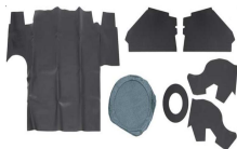
1971-1974 Trunk Kit - 7pc

Complete trunk kit includes: 2 Side Panels, Trunk Mat, Spare Tire Cover, Spare tire ring, 2 Hinge Covers. Call for multiple colours, styles or patterns or choose online