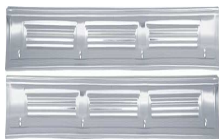
1971-1974 Door Sill Plates - PR

Jute Backing and Dimmer Switch are all part of the package. 1971-1973 Cars use the 80/20 Loop 2 piece Kit 1974 Cars use the 120 Cut Pile one Piece. Call for multiple colours, styles or patterns or choose online