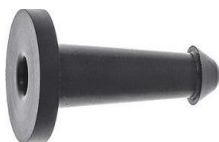
1973-1974 Firewall Insulation Fastener (Rubber) - Ea

Reproduction firewall insulation fasteners for all 1973-74 Mopar A, B, and E-Body models. These fasteners are made to the same specifications using molded rubber materials as the original, have a 3/4" diameter head and are 1-1/4" long. Installed on cars built after September 1972.